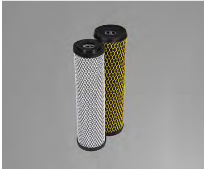
DWCC and DWCF filters reduce chlorine taste, odor, many organic chemicals, oil, and particulates

DWC Series cartridges also provide fine sediment filtration to 5 microns and are available in lengths to 40" and three diameters. Plastisol end caps are standard with optional end fittings available to match a variety of housings.