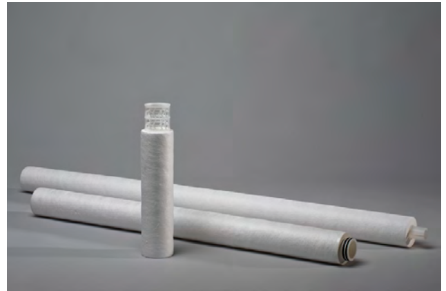
MB Series melt blown cartridge filters feature an economical and strong self-supporting fiber matrix

MB Series cartridges are made entirely of FDA 21CFR 177.1520 compliant polypropylene which provides exceptional chemical compatibility to handle a wide range of process fluids. MB Series cartridges offer economical filtration with flow rates of up to 5 gpm per 10" length and a maximum operating temperature of 180° F. MB Series cartridges are designed for knife-edge seal housings without the use of gaskets or seals. A wide variety of end cap options are also available.