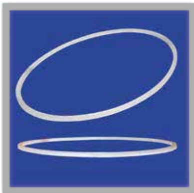
7" D - Polypropylene Ring P1PP & P2PP

Custom ring sizes and titanium rings available upon request.