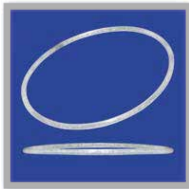
4" D - Polypropylene Ring P3PP & P4PP