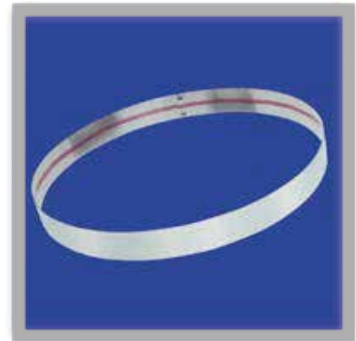
Commercial Snap Ring C1 & C2